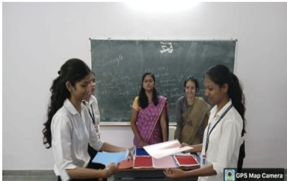
Students engaged in the memorial exchange program conducted during draw of lot