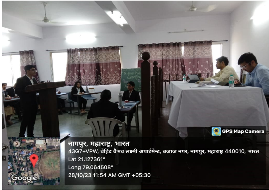
Students engaged in the Moot Court Competition as mooters in Moot Court Hall A